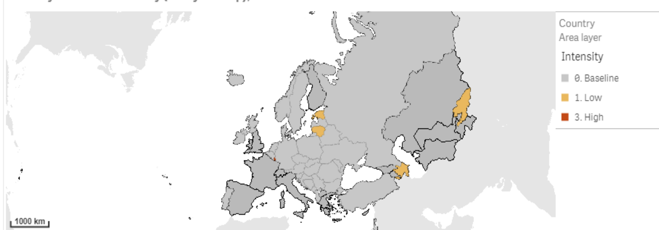
Intensity of influenza activity (EU layout map), 2021-W41

© World Health Organization 2021 © European Centre for Disease Prevention and Control 2021 Reproduction is authorised, provided the source is acknowledged